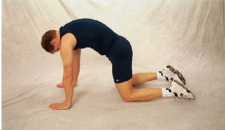
Cat/Camel , arch back, flex neck