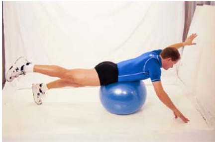
over exercise ball