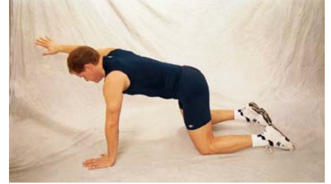
Quadruped , with arm extension