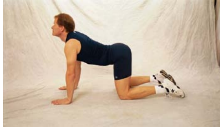
extend neck, drop back