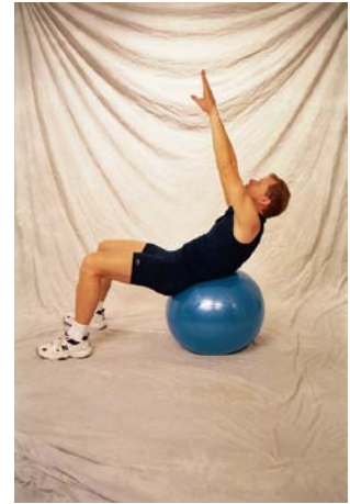
Sit-up on ball, tuck chin as you reach.