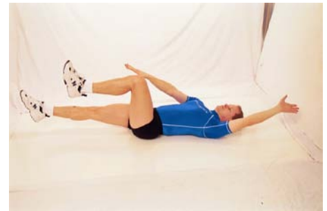
right hand to left knee.