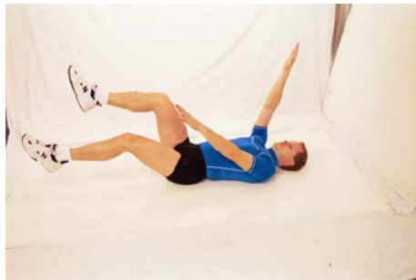
alternating left hand to right knee,