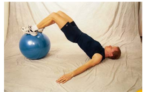
to a hamstring curl.