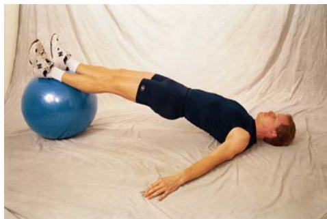
to a bridge,