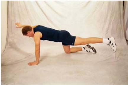
Alternate arm and leg extension