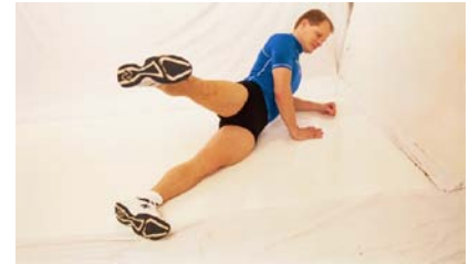
Keep the leg and thigh in line with body. Do NOT rotate foot and body backwards (as below).