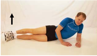
Side lying position.