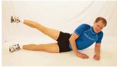
Abduct leg straight up.