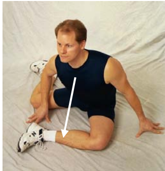
2. To mid-shin