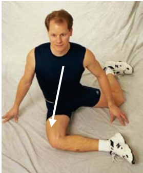
1. To knee