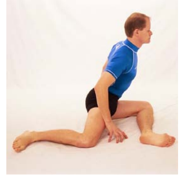
Maintain low back curve, (neutral lordosis) as you lean forward.