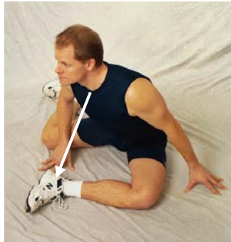
3. To foot

Start with the right thigh forward of body, stretch all three positions, then switch to left thigh forward, and stretch all positions. Avoid poking the chin out. Try to maintain a neutral neck posture. You should feel the stretch in the hips and butt, not in the low back.