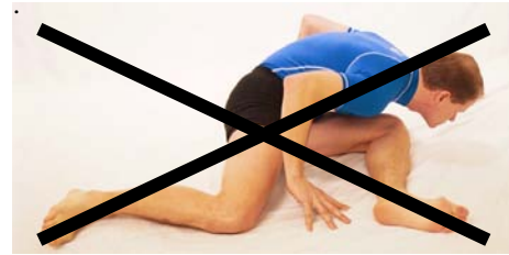
Wrong, do not flex from waist.

Thighs and legs are 90° to body. Neutral back position, lean forward, chest out, (holding the stretch in each position for 15-30 seconds) 1. to knee, 2. mid-shin, and 3. to foot,. Switch sides and repeat.