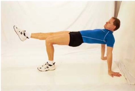
Single leg extension Bridge.