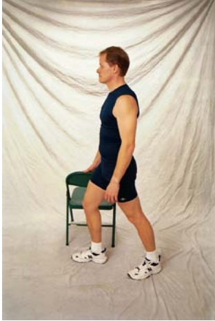
Basic Lunge avoid exceeding 90° knee bend.