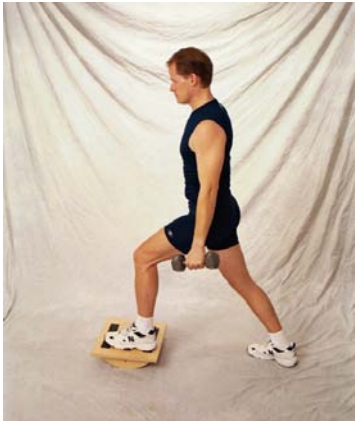
Lunge to a Rocker Board with weights to a "fly."