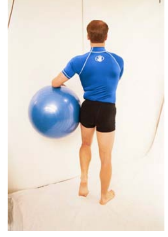
Hip Hiker on ball against wall.