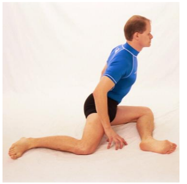
Maintain low back curve, (neutral lordosis) as you lean forward.