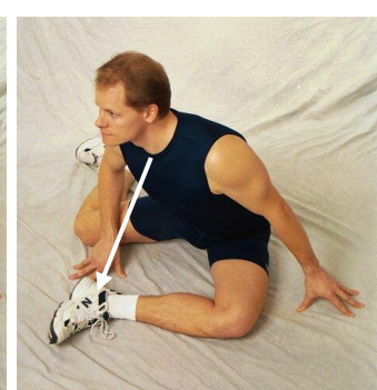
switch to left thigh forward, and stretch all positions. Avoid poking the chin out. Try to maintain a neutral neck posture. You should feel the stretch in the hips and butt, not in the low back.

Start with the right thigh forward of body, stretch all three positions, then