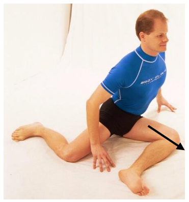
Start with one knee in front and one knee to the side.