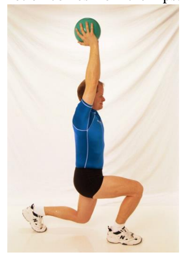
Push the weight overhead.